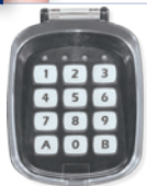
Black model available

Internal / External Use CR2450 Battery (Inc) Up to 100m Outdoor Range Frequency 433.92Mhz 2 Channels H90 x W70 x D40mm